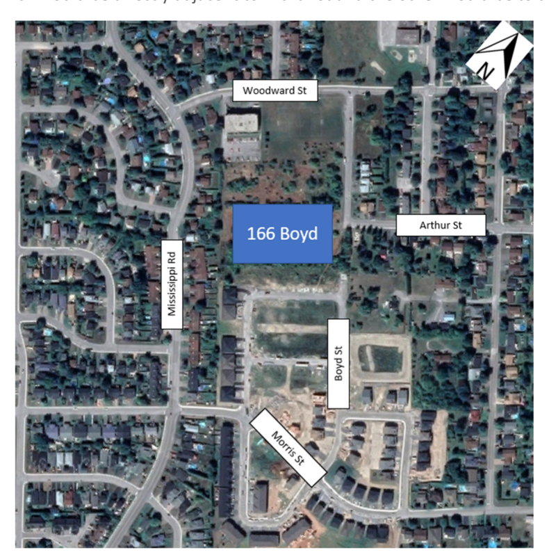
Figure 1 - Study Area

The location of the development is illustrated in Figure 1. The development will have two accesses connected to Boyd Street, one of which would be directly adjacent to Arthur St and the other would be to the south of Arthur.