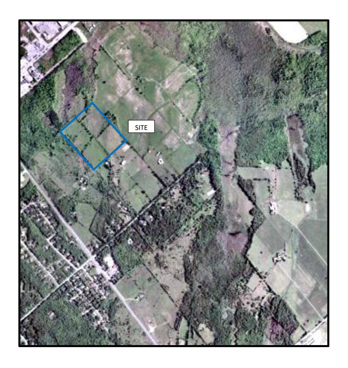
AERIAL PHOTOGRAPH 2005