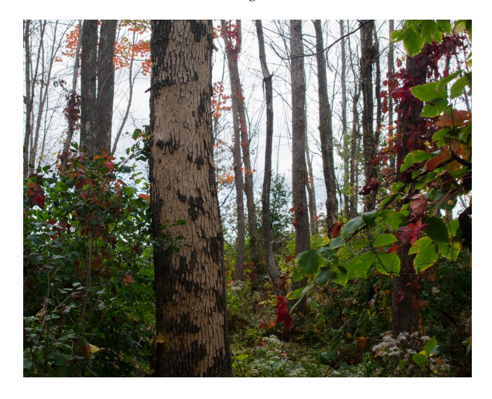
Photo 5 – Impacts of emerald ash borer on the ash forest in the northeast corner of the site. View looking west