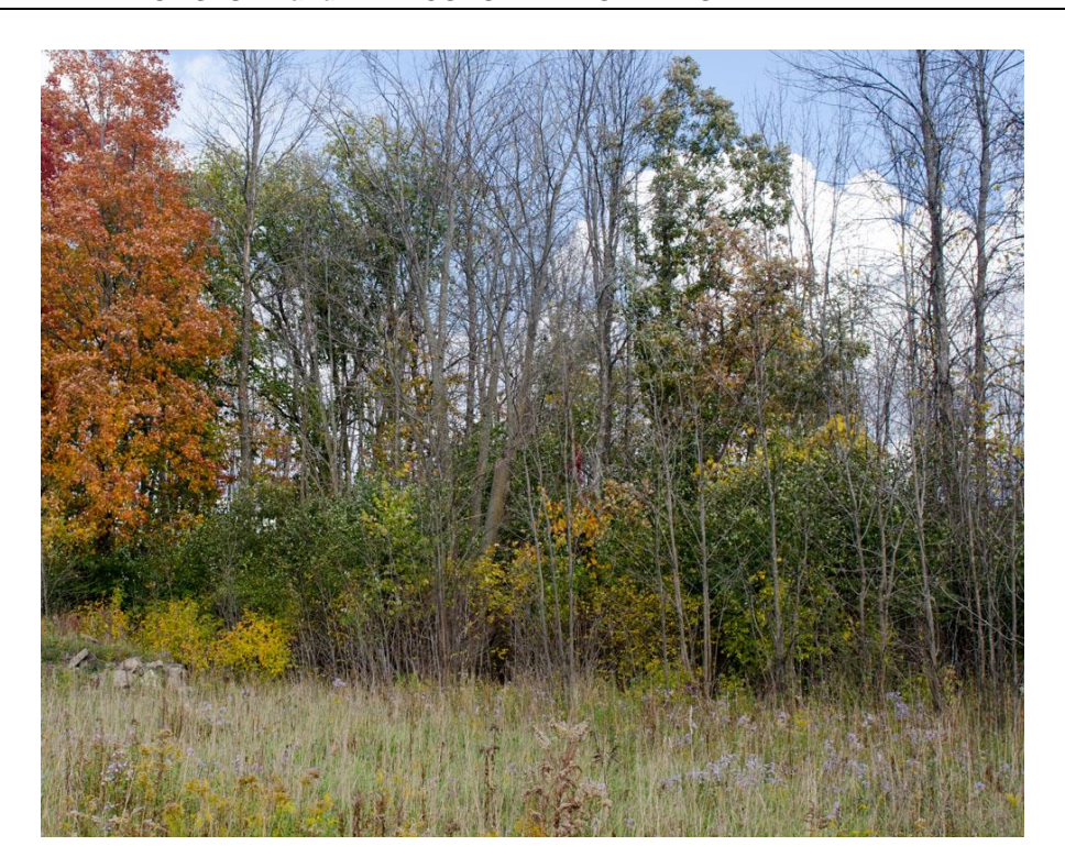
Photo\ 4-Upland\ ash\ deciduous\ forest\ in\ the\ northeast\ corner\ of\ the\ site. View\ looking\ northeast