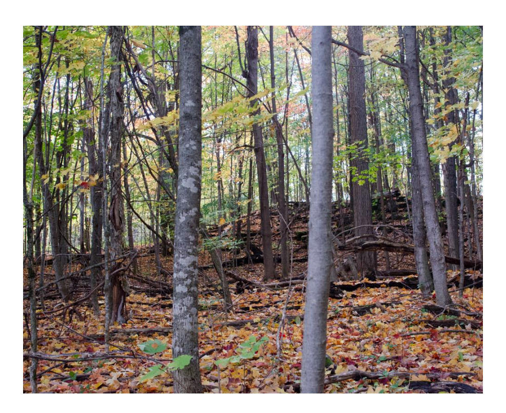
Photo 1 – Upland maple forest in the northwest portion of the site. View looking southwest

Wildlife observed during the field surveys included wild turkey with immatures, song sparrow, northern flicker, eastern kingbird, American robin, eastern phoebe, least flycatcher, great-crested flycatcher, European starling, common grackle, red-winged blackbird, common yellowthroat, yellow warbler, American woodcock, American crow, American goldfinch, mourning dove, black-capped chickadee, northern cardinal, blue jay, eastern chipmunk, red squirrel, woodchuck, and white-tailed deer tracks. A few of the sugar maples in a former west-east hedgerow in the south portion of the upland maple deciduous forest contained potential wildlife cavities and a large snag was also present here. A few rock piles which may provide snake hibernacula were noted in the cultural thickets and along the edges of the meadow habitats. No snakes were observed during the 2020 field surveys, with one garter snake noted in the 2012 surveys as part of the natural heritage component of the Highway 7 South Conceptual Development Plan. This observation was approximately 450 metres to the northeast of the northeast corner of the current site.