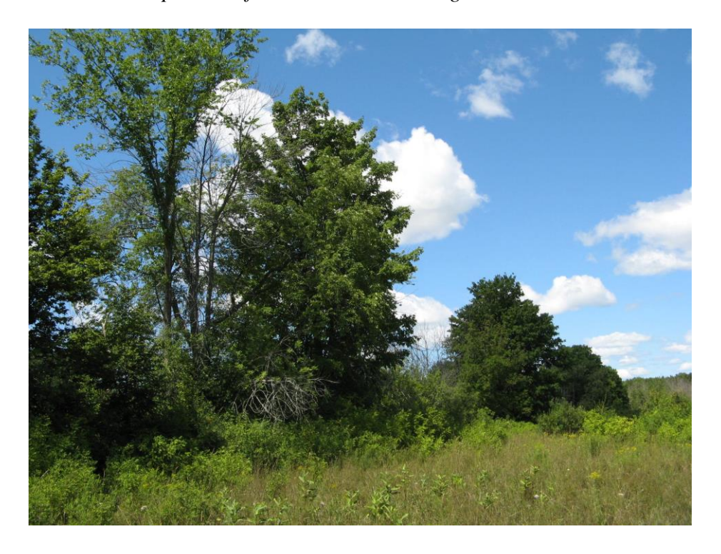
Photo 13 – South portion of north-south deciduous hedgerow in the east portion of the site. View looking northwest