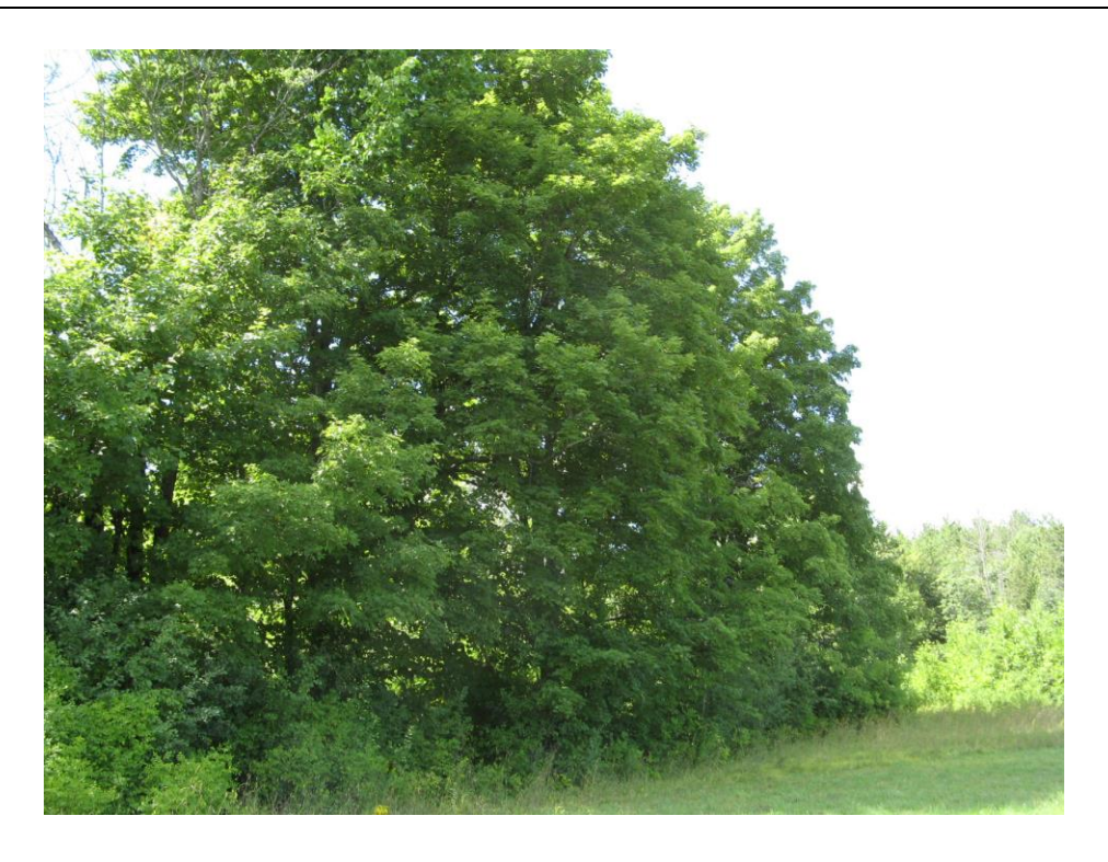
Photo 12 – Mature sugar maples in the north portion of the north-south hedgerow in the central portion of the site. View looking northwest