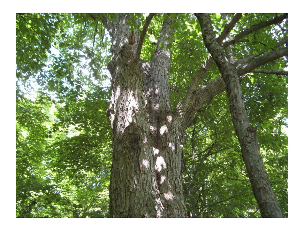
Photo 2 – Mature sugar maple along former fence line in the maple forest in the northwest portion of the site. View looking northeast