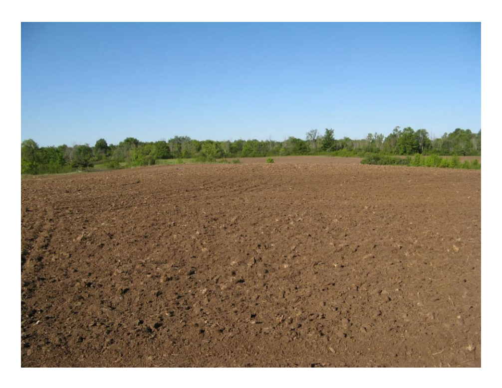
Photo 6 – Ploughed fields in the southeast portion of the site. View looking northwest to intermittent hedgerow, ploughed field, and mores established hedgerows in the background