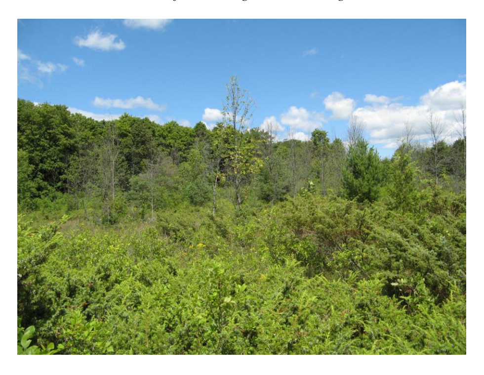
Photo 9 – Cultural thicket habitat in the northwest portion of the site. View looking northeast to the maple forest in the background