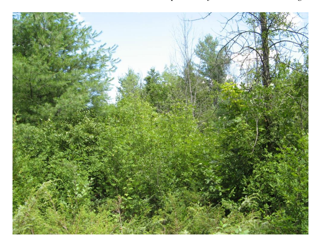
Photo 11 – Cultural woodland in the north-central portion of the site. View looking southeast