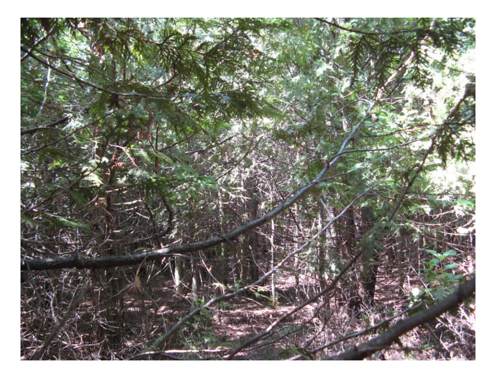
Photo 3 - Typical tree size and density of the upland cedar coniferous forest in the west portion of the site. View looking northwest