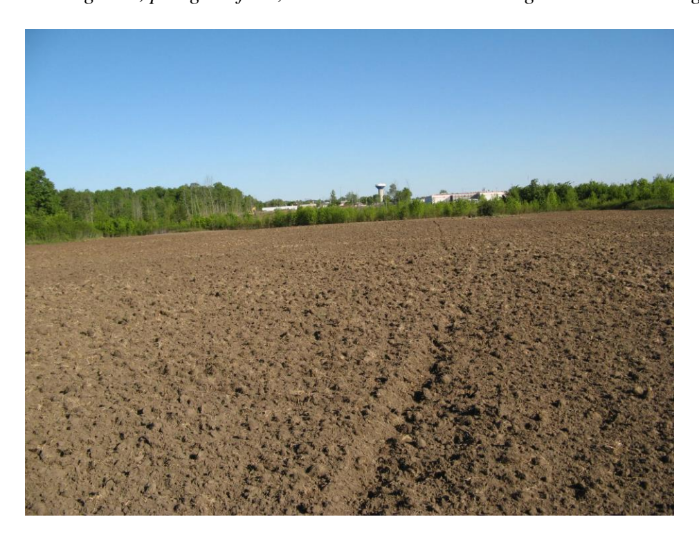
Photo 7 – Ploughed field in the southeast corner of the site. View looking north