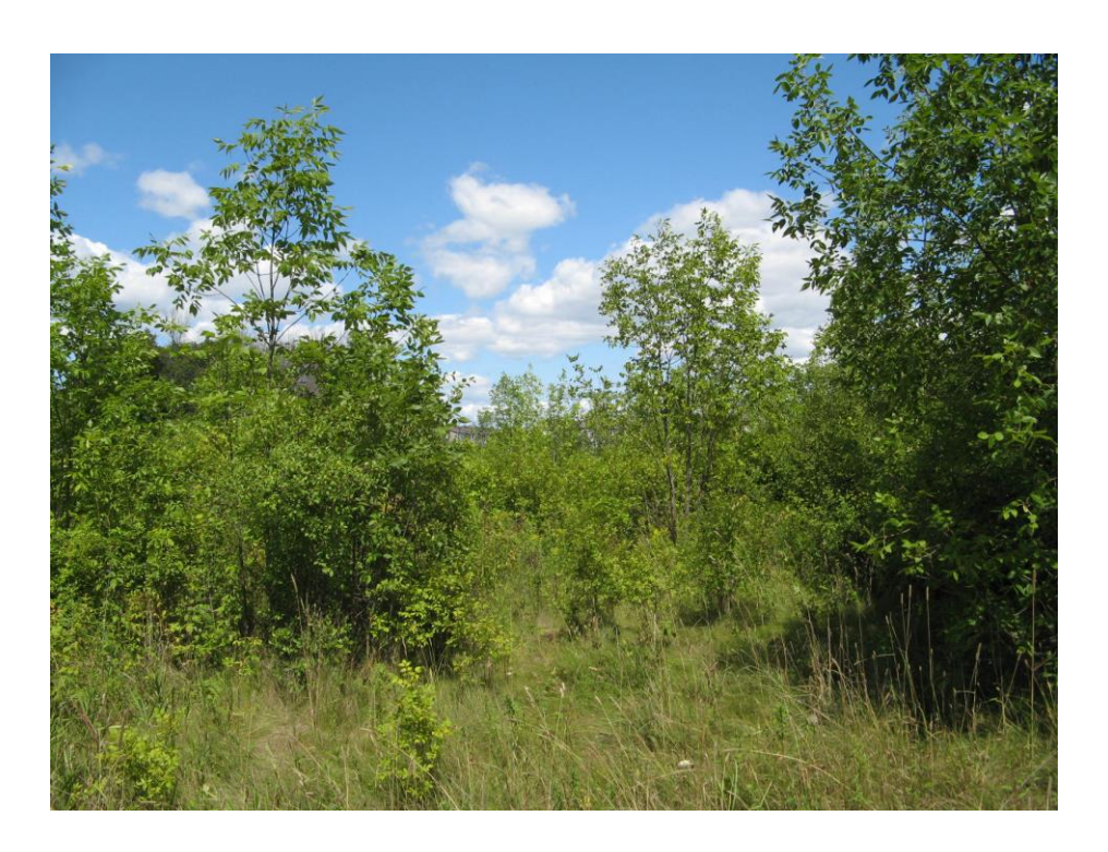
Photo 10 – Cultural thicket in the northeast portion of the site. View looking north