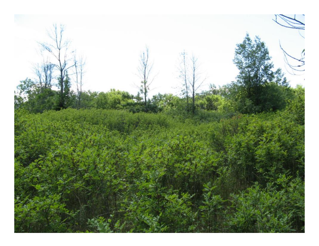
Photo 8 – Dense coverage of prickly ash in the thicket habitat in the west-central portion of the site. This is not fun walking! View looking southwest