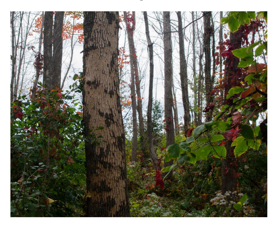
Photo 5 – Impacts of emerald ash borer on the ash forest in the northeast corner of the site. View looking west