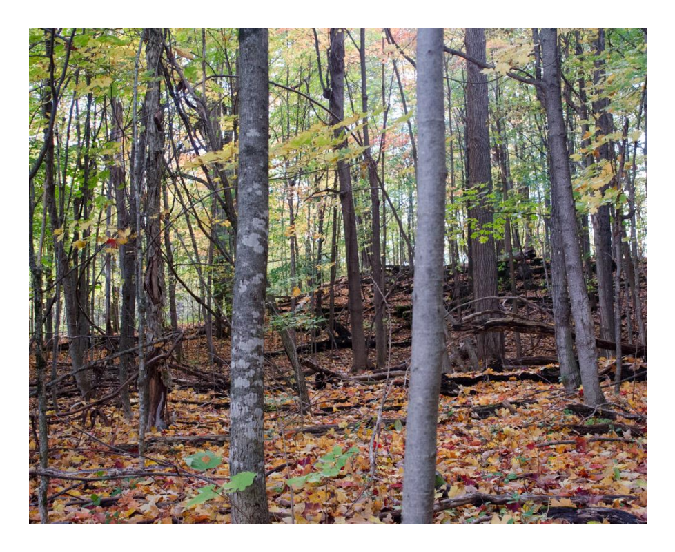
Photo 1 – Upland maple forest in the northwest portion of the site. View looking southwest

Wildlife observed during the field surveys included wild turkey with immatures, song sparrow, northern flicker, eastern kingbird, American robin, eastern phoebe, least flycatcher, great-crested flycatcher, European starling, common grackle, red-winged blackbird, common yellowthroat, yellow warbler, brown thrasher, American woodcock, American crow, American goldfinch, mourning dove, black-capped chickadee, northern cardinal, blue jay, eastern chipmunk, red squirrel, woodchuck, and white-tailed deer tracks. A few of the sugar maples in a former west-east hedgerow in the south portion of the upland maple deciduous forest contained potential wildlife cavities and a large snag was also present here. A few rock piles which may provide snake hibernacula were noted in the cultural thickets and along the edges of the meadow habitats. No snakes were observed during the 2020 field surveys, with one garter snake noted in the 2012 surveys as part of the natural heritage component of the Highway 7 South Conceptual Development Plan. This observation was approximately 450 metres to the northeast of the northeast corner of the current site.