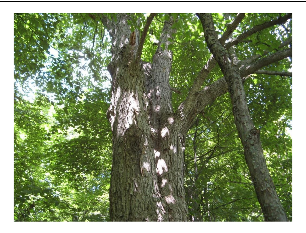
Photo 2 – Mature sugar maple along former fence line in the maple forest in the northwest portion of the site. View looking northeast