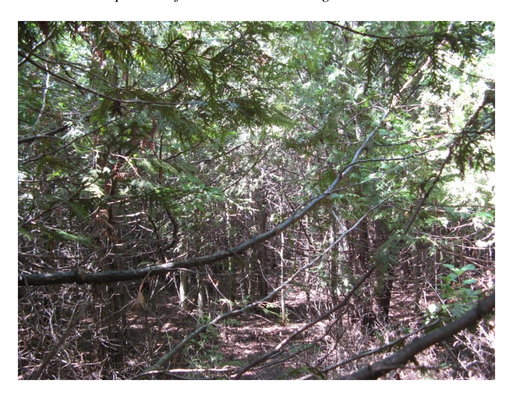
Photo 3 - Typical tree size and density of the upland cedar coniferous forest in the west portion of the site. View looking northwest