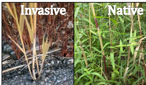
Comparison of invasive and native stems.

EDD MapS Ontario Early Detection & Distribution Mapping System