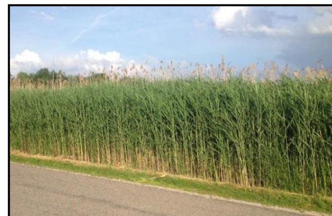
Invasive Phragmites spotted near Perth, ON

Following removal, seal in a black garbage bag and leave in the sunlight for 1-3 weeks. Dispose of as household garbage. Alternatively, dried plants may be burned.