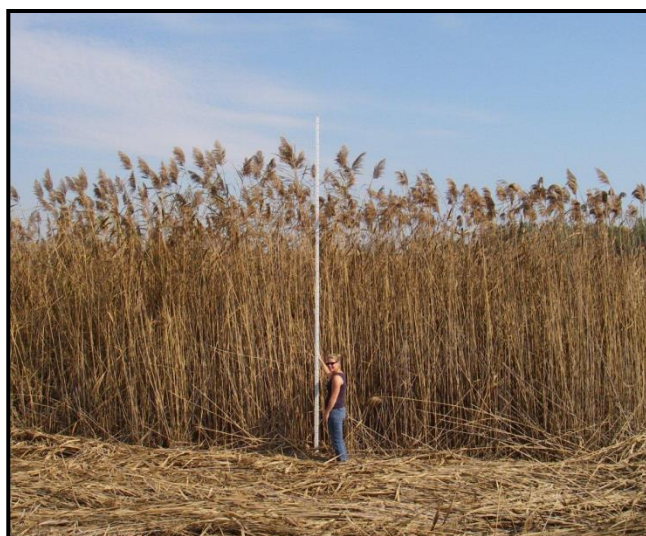
Tall stand of dead invasive Phragmites

Apply herbicide between early spring and late fall. Remove any dead stalks to improve herbicide effectiveness. Cells may need to be treated more than once.