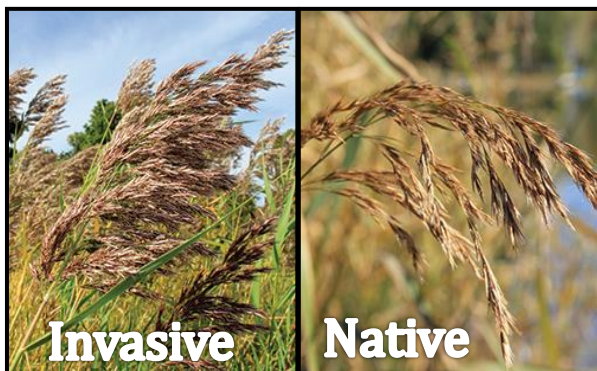
Comparison of invasive and native cells (top) and seed heads (bottom).