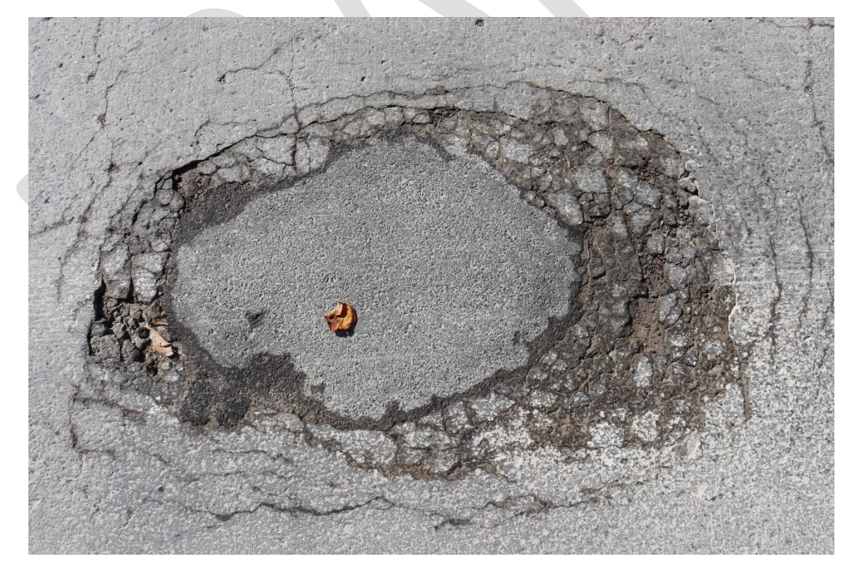
Image 5. Concerning pothole cracks with asphalt patch on deck of middle bridge