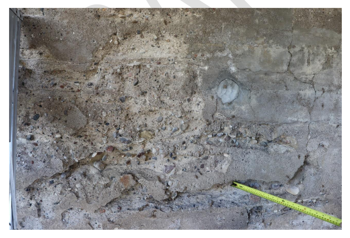
Image 8. East abutment disintegration and spalling of east bridge to 100 mm depth