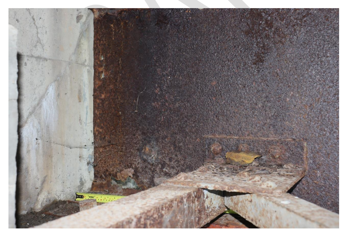
Image 52. Perforation of north girder end on west abutment of west bridge