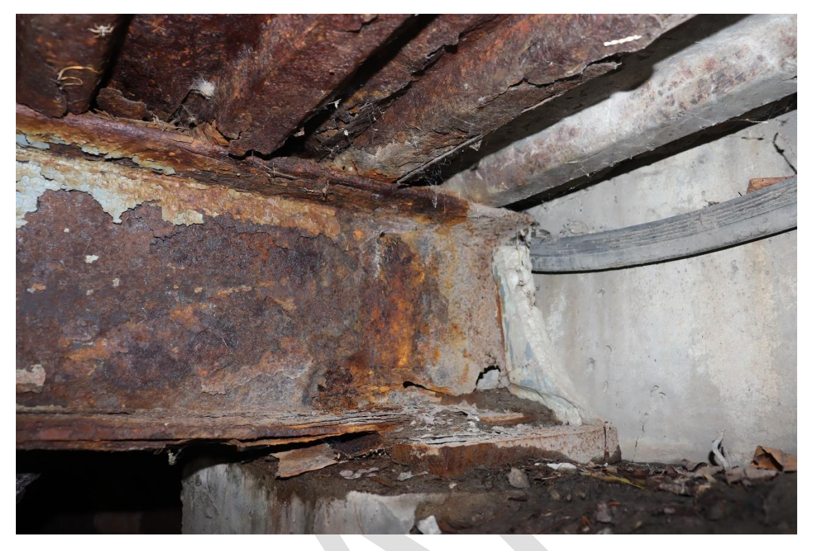
Image 13. Perforation of 1st stringer from south of middle bridge west abutment