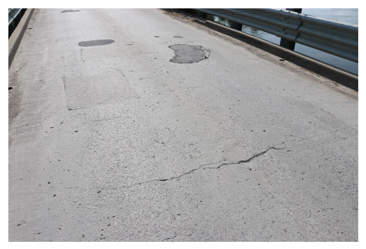
Image 5 Typical deck with concrete patches, cold patches, cracking, and delamination