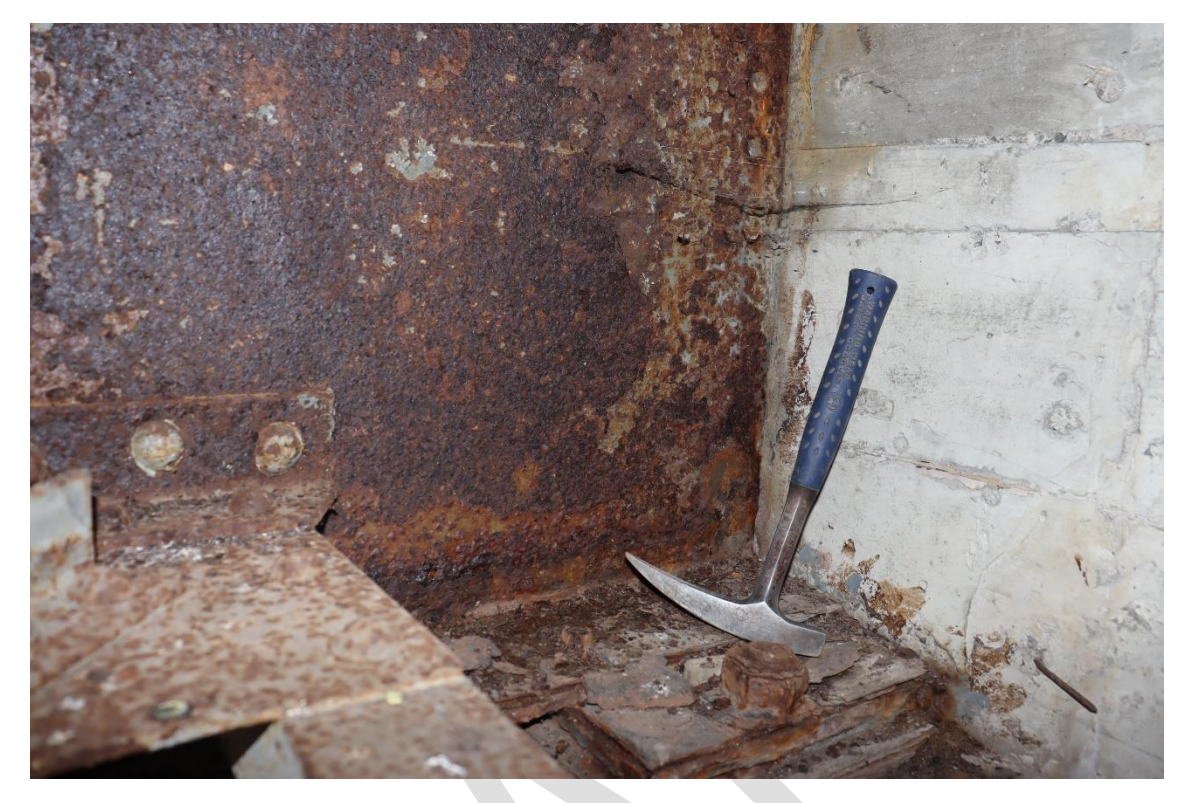
Image 43. Web thinning of north girder end on east abutment of west bridge