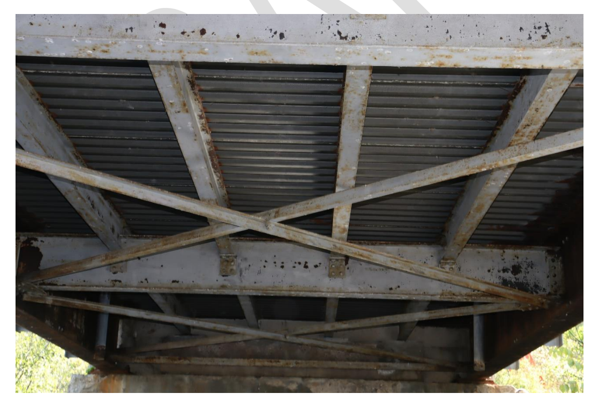
Image 9. Soffit & steel floor system of east span of middle bridge facing east