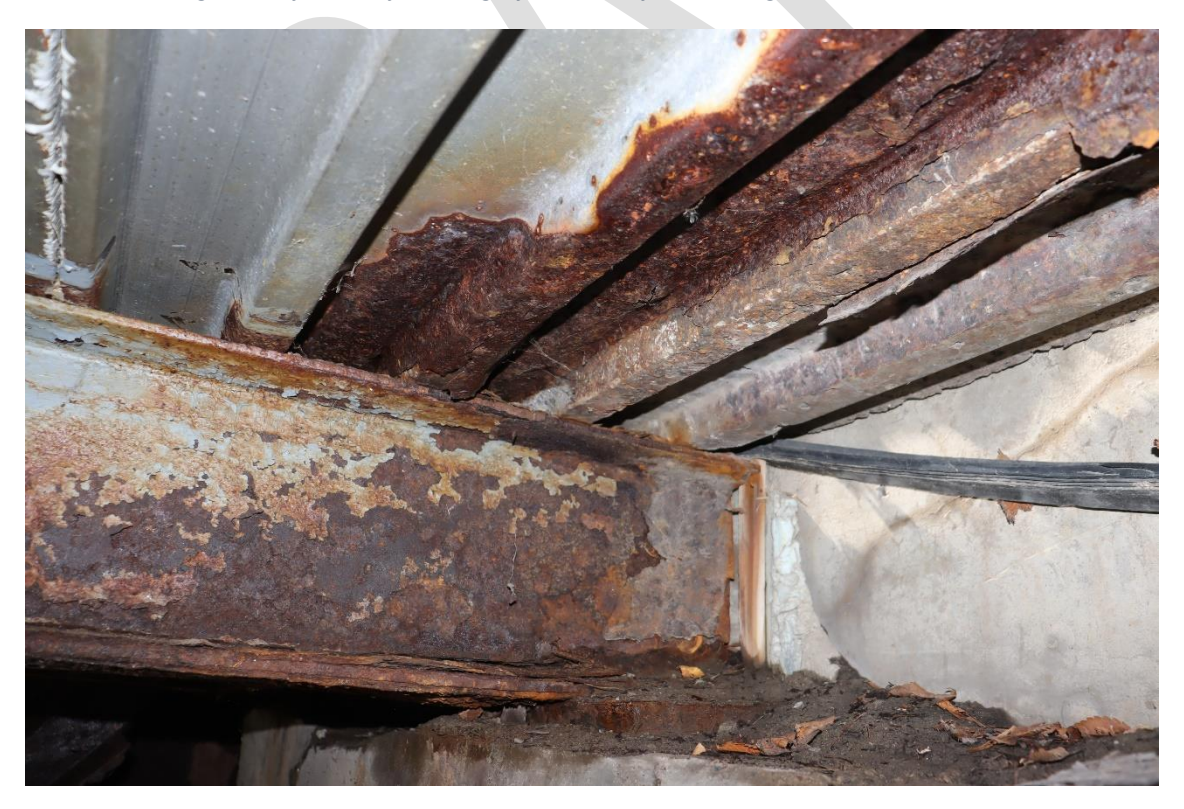
Image 14. Perforation of 2nd stringer from south of middle bridge west abutment