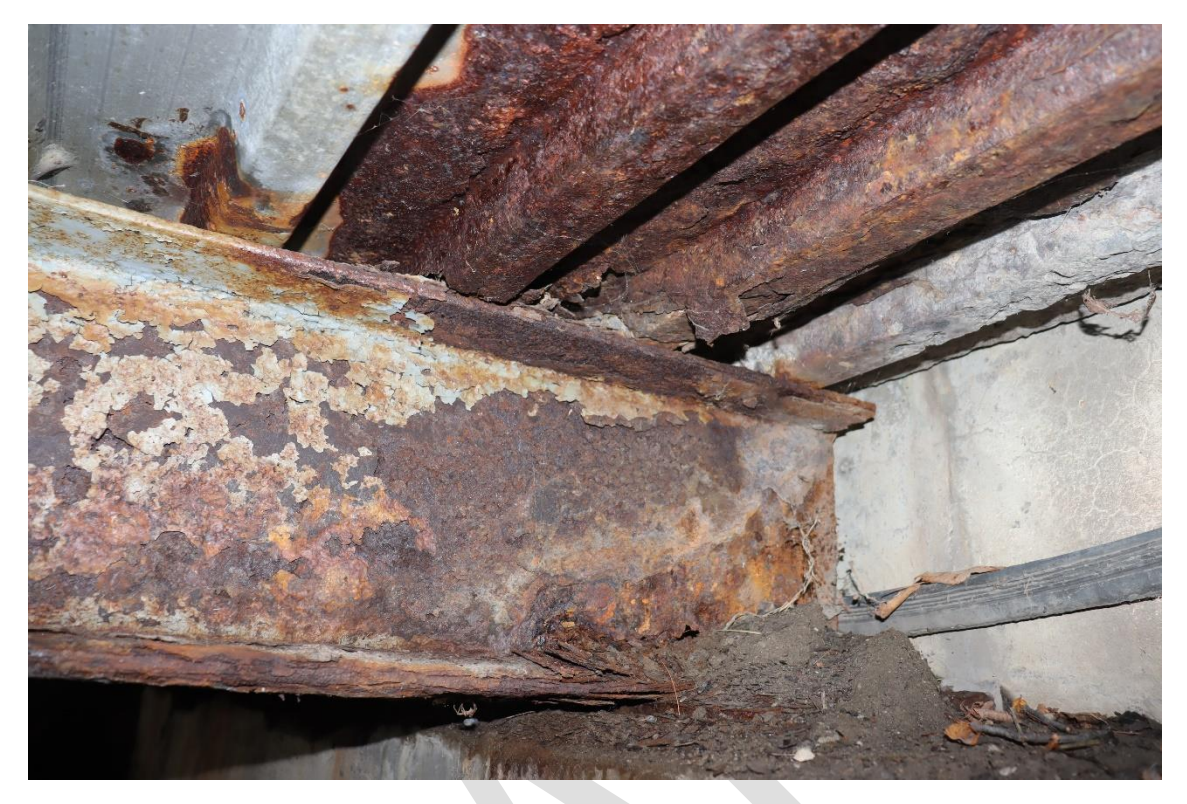
Image 15. Perforation of 3rd stringer from south of middle bridge west abutment