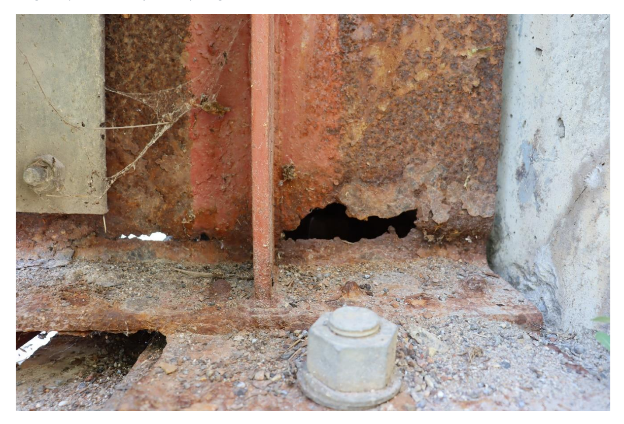
Image 2 Perforated main girder north side of west span at west abutment, with strengthening added