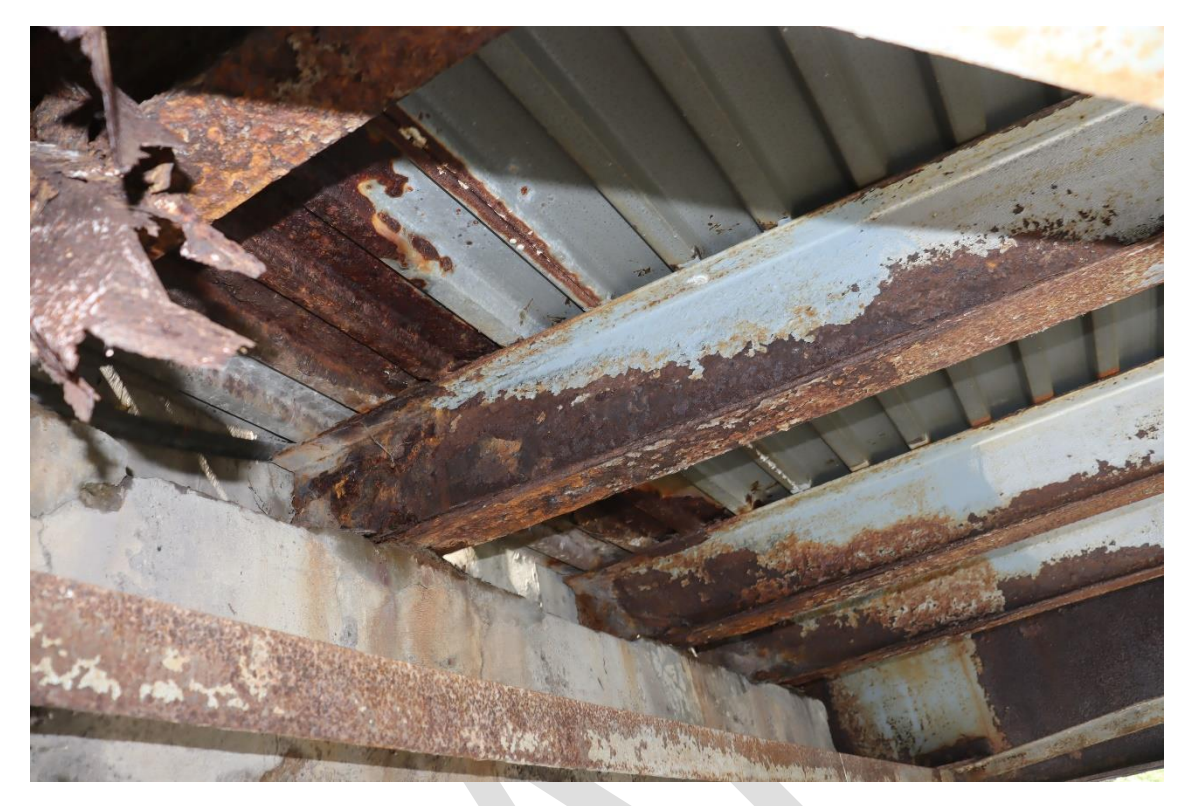
Image 29. General condition of stringer ends of middle bridge at west abutment