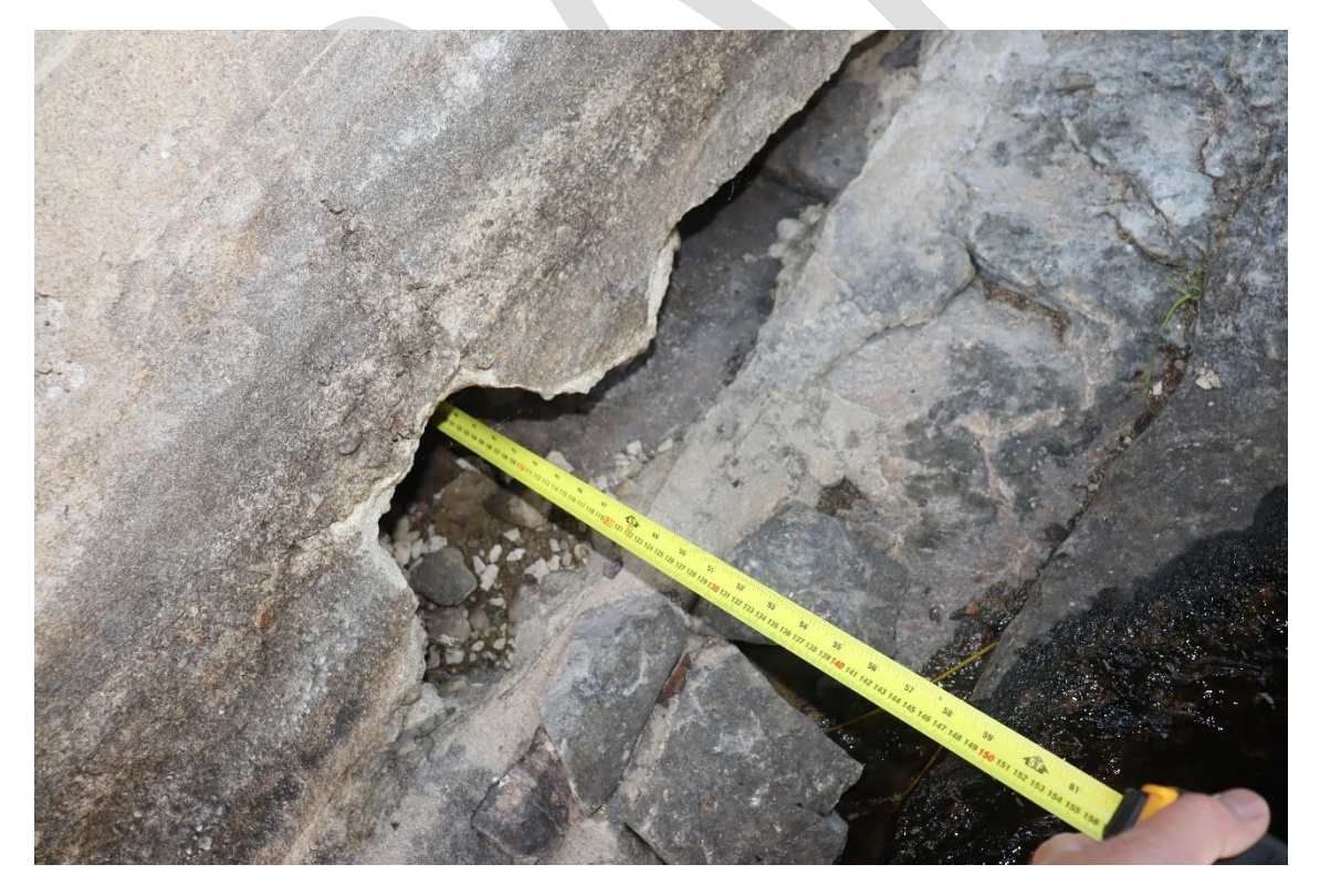
Image 14. West abutment 1.2 m deep cavitation undercut, east bridge