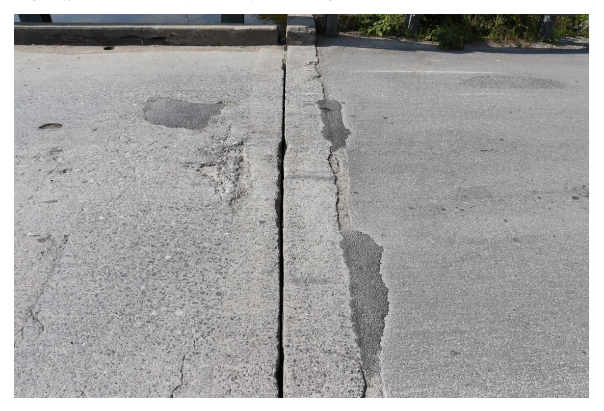
Image 6 Typical deck end and open expansion joint that admits chlorides to girder ends