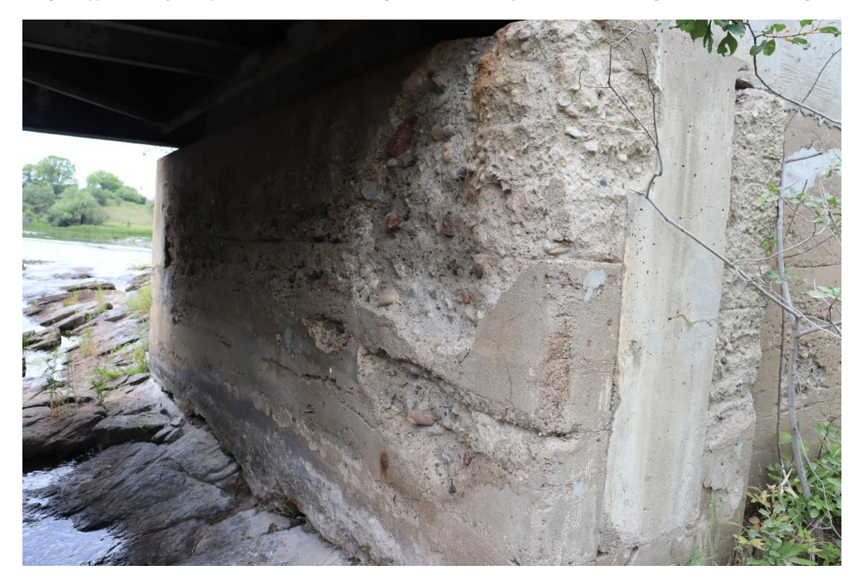
Image 8 Severe disintegration of 1912 concrete and undercutting of foundation at bedrock surface