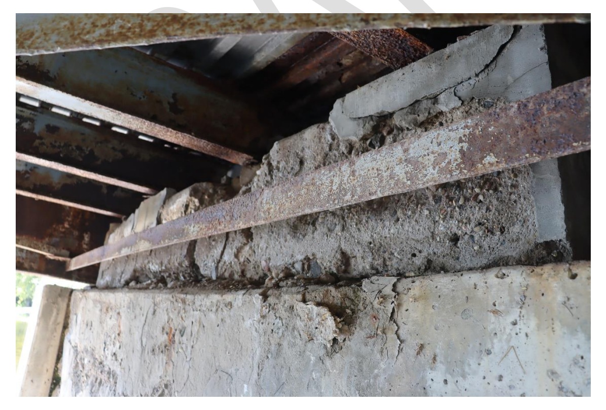
Image 25. Disintegration of ballast wall above west abutment of west bridge