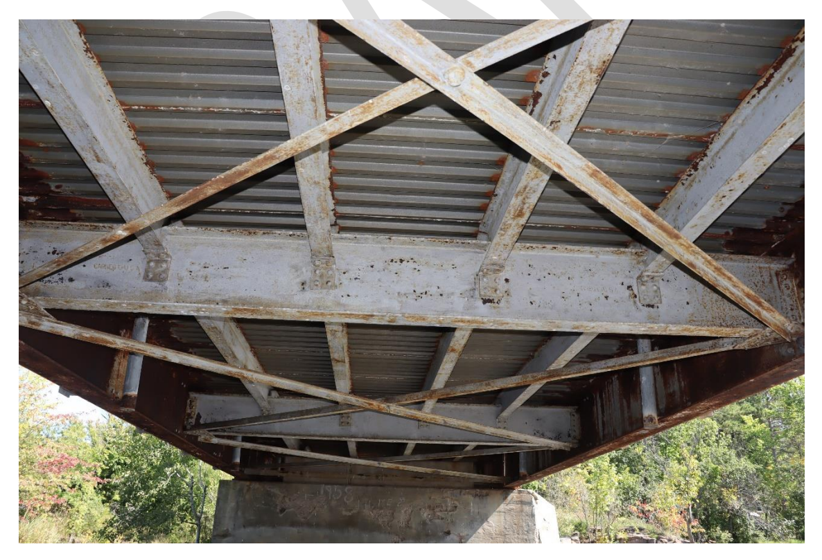
Image 16. Soffit & floor system of west span of middle bridge facing east