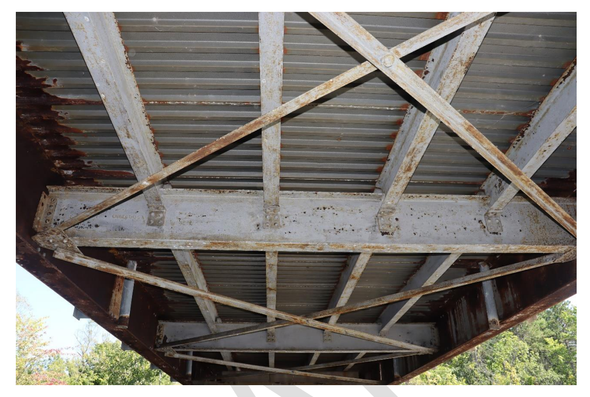
Image 12. Soffit & floor system of west span of middle bridge facing east