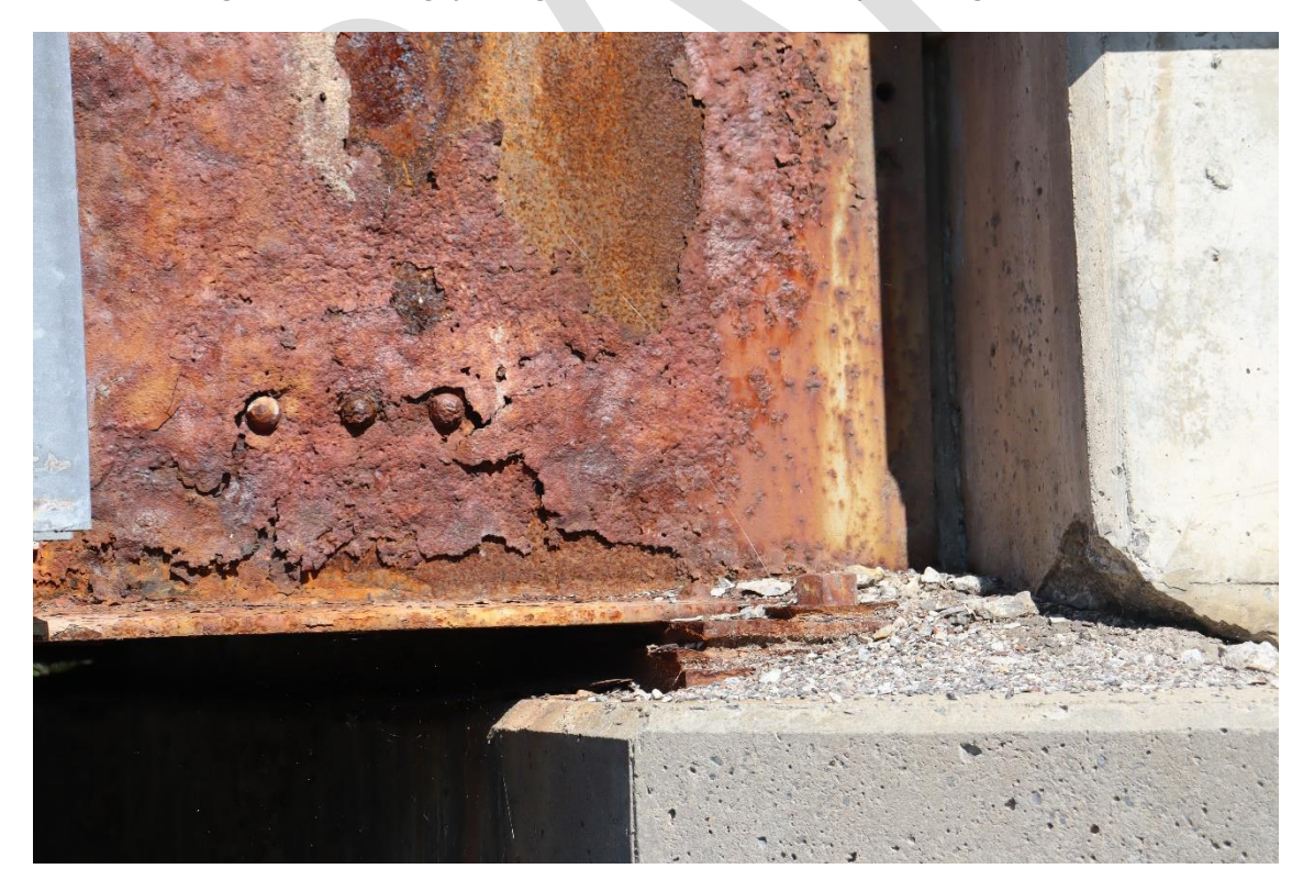
Image 23. Exterior face south girder on east abutment of west bridge