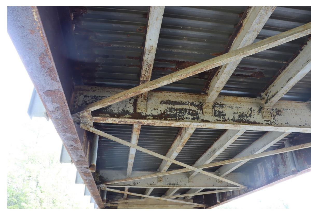
Image 7 Typical steel floor system with exterior main girders, transverse floor beams, and longitudinal internal stringers