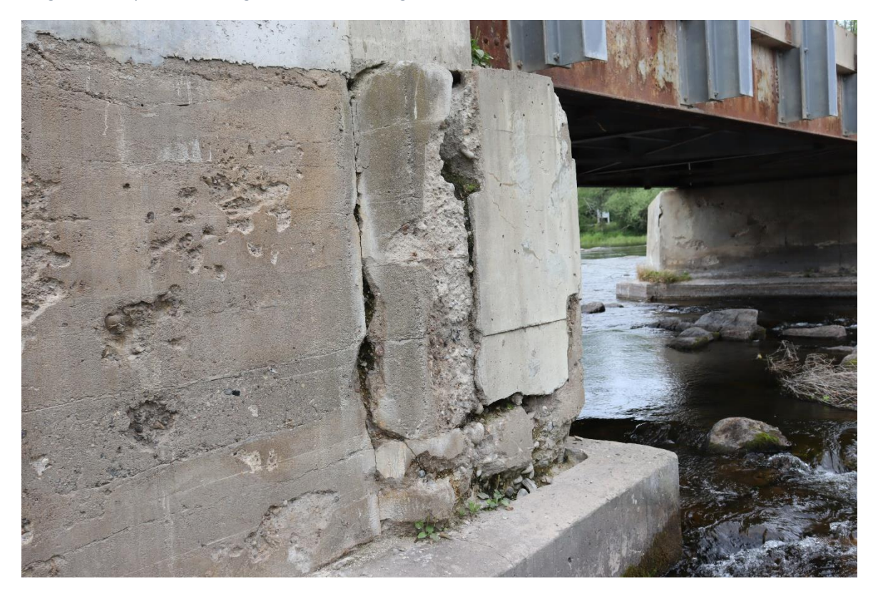
Image 4 Severely deteriorated substructure concrete with prominent patch