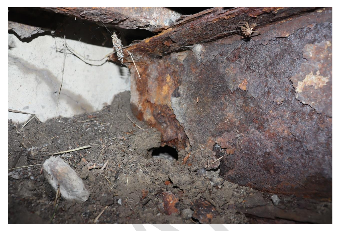
Image 26. West end of Stringer 2 with debris and perforation on west bridge