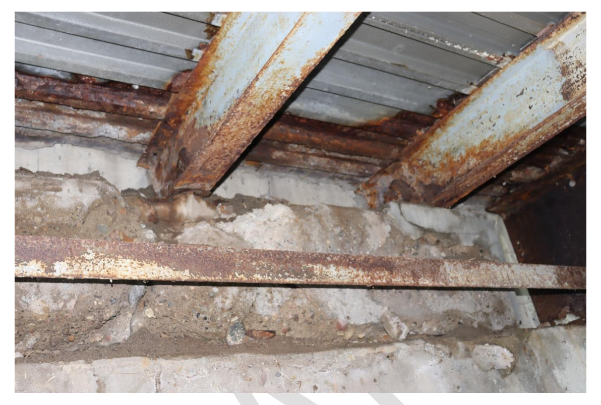
Image 53. General western bearing area of northern 2 stringers of west bridge