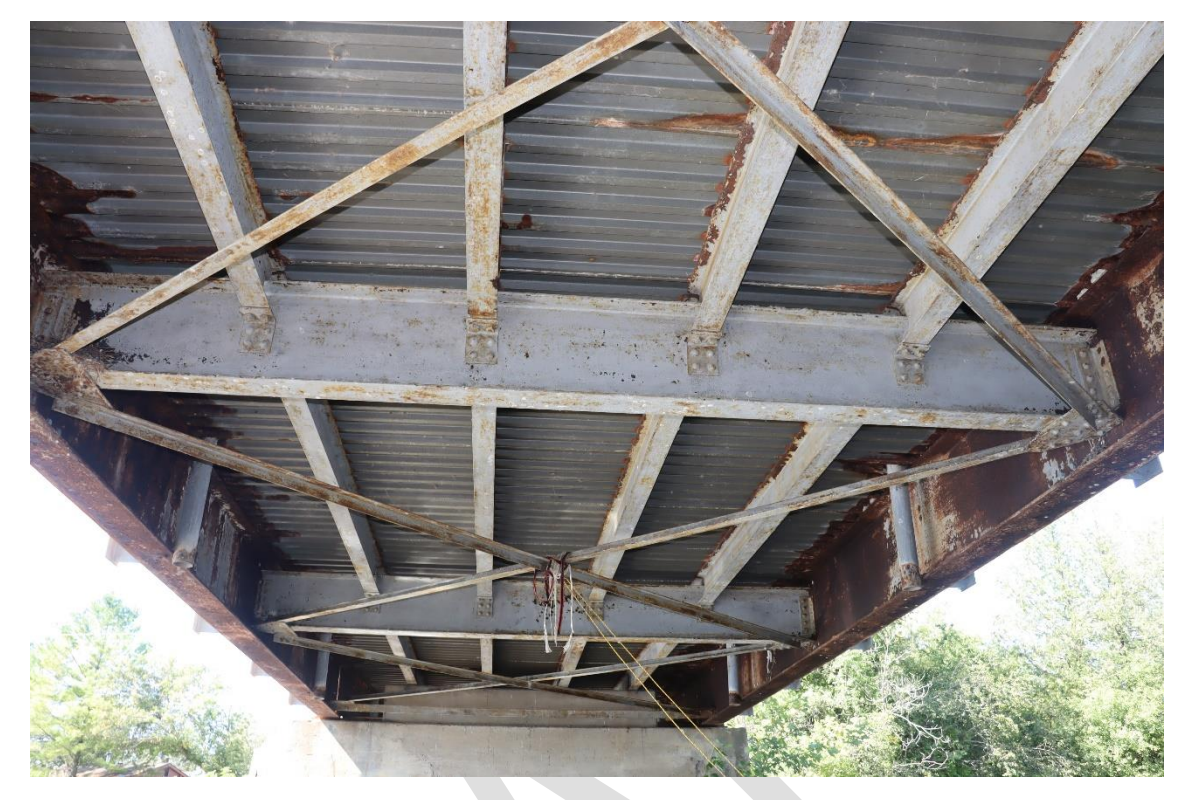
Image 21. Soffit & floor system of east span of west bridge facing west