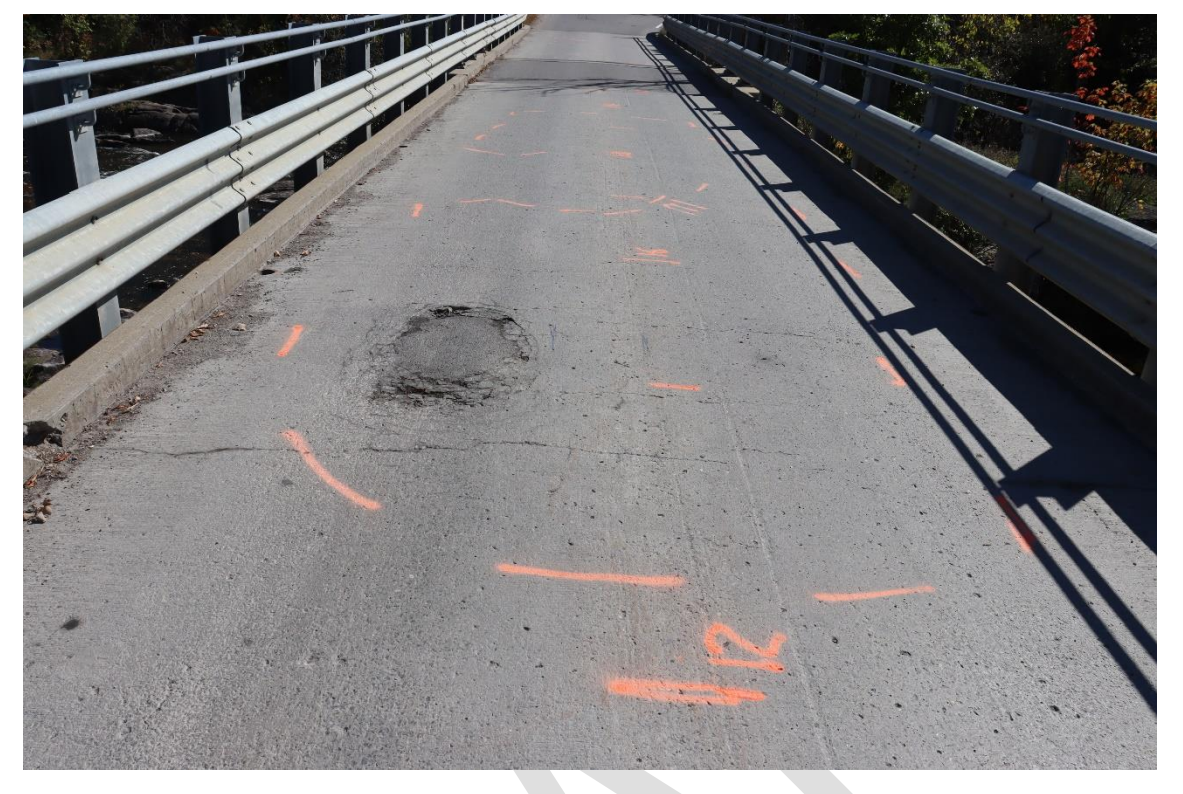
Image 30. Middle to east end of middle bridge deck condition survey