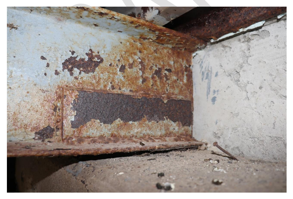
Image 12. Web patch on 3rd stringer from south on east abutment of east bridge