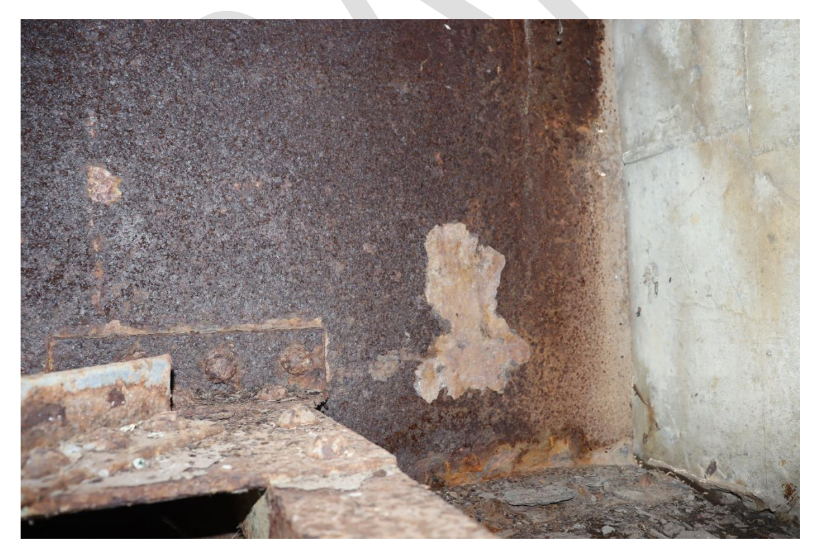
Image 30. Web thinning of south girder end of middle bridge west abutment