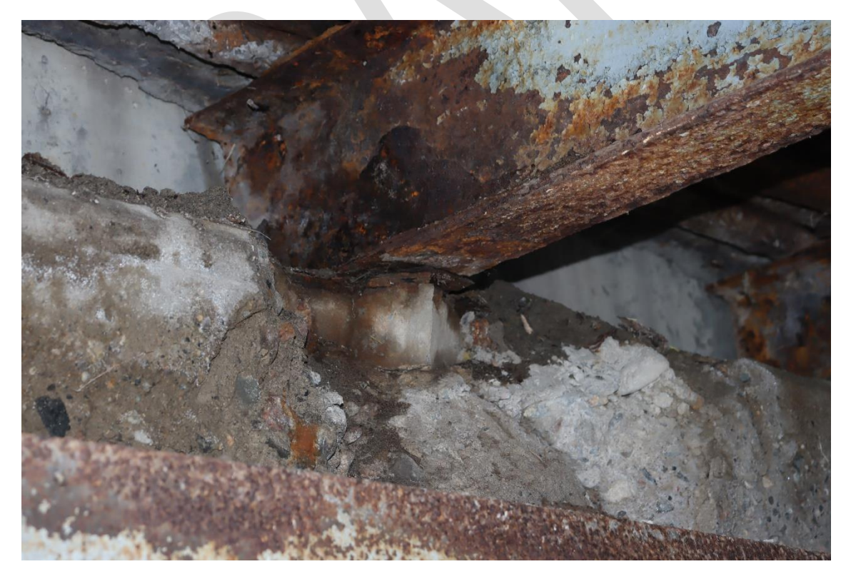
Image 27. Disintegration of west bearing seat of west bridge at Stringer 3